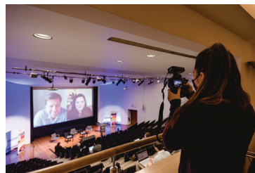
Producing a digital conference.